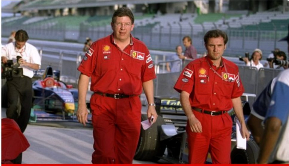
F1 motorsport boss Ross Brawn (left) and new F1 CEO Stefano Domenicali worked together at Ferrari during their period of dominance in the 2000s, as Technical Director and Team Manager respectively

Greg Maffei, Liberty Media President and CEO, said he was excited to welcome Domenicali to Formula 1, while also paying tribute to Carey, who he said will continue to play an important role.